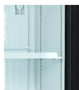
LED light inside door frame