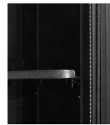
LED light inside door frame