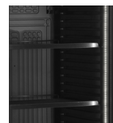
LED light inside door frame