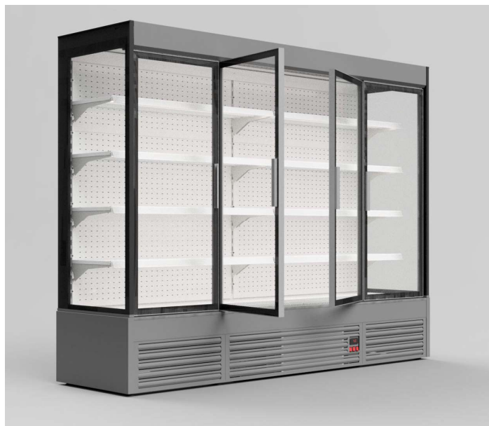
GLASS SIDE VERSION