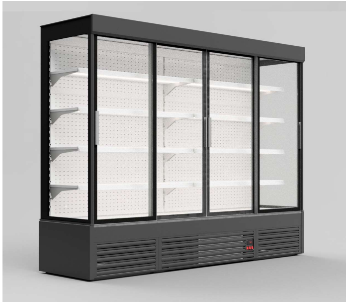
GLASS SIDE VERSION