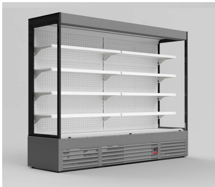
GLASS SIDE VERSION